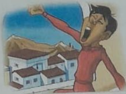
Mexico City 6:00 A.M.