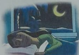
Los Angeles 4:00 A.M.