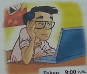
Tokyo 9:00 P.M.

What's Permsak doing? He's eating dinner right now.