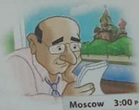
Moscow 3:00 P.M.

What are Jim and Ann doing? It's noon, so they're eating lunch.