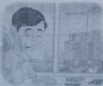
Bangkok 7:00 P.M.