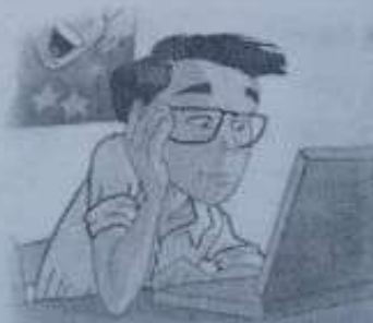
Tokyo 9:00 P.M.