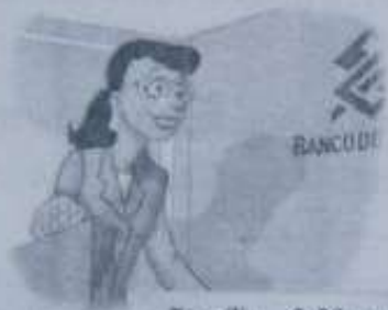
Brasilia 9:00 A.M.