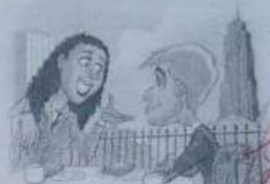
New York City 7:00 A.M.