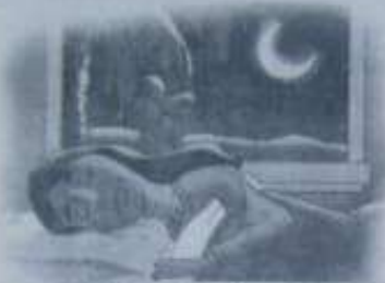
Los Angeles 4:00 A.M.