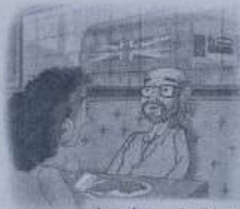
London 12:00 noon