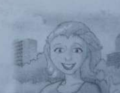
Your city 00:00