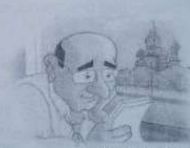
Moscow 3:00 P.M.