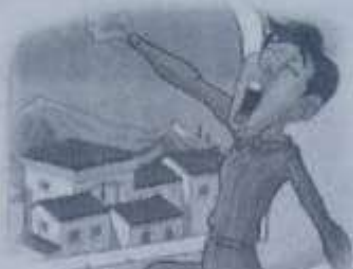
Mexico City 6:00 A.M.