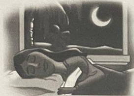
Los Angeles 4:00 A.M.