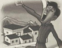
Mexico City 6:00 A.M.