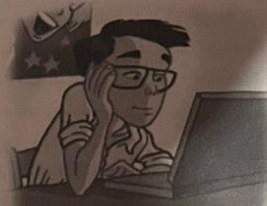
Tokyo 9:00 P.M.