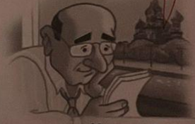
Moscow 3:00 P.M.

What are Jim and Ann doing? It's noon, so they're eating lunch.