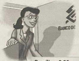
Brasília 9:00 A.M.

What are Sue and Tom doing? They're having breakfast.