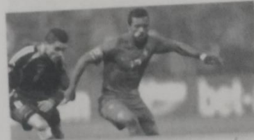
4. Nani is a soccer player