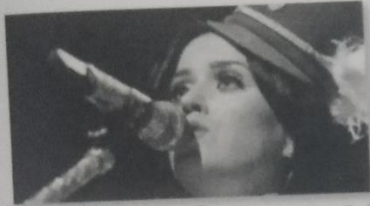
1. Katy Perry is a singer