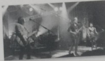
2. The Kings of Leon are a rock band