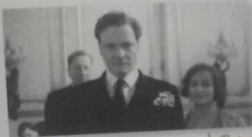
3. Colin Firth is an actor