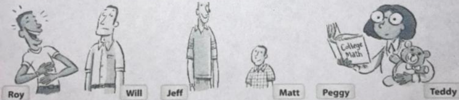
Roy Will Jeff Matt Peggy Teddy

2. Ike is handsome . Barb is pretty . 3. Oscar is serious . Felix is thin . 4. Jackie is talkative . Cindy is quiet .