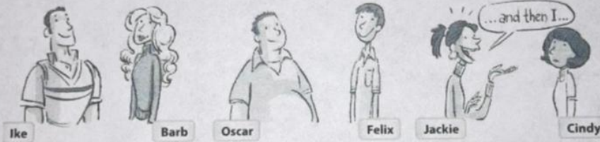
Ike Barb Oscar Felix Jackie Cindy

2. Ike is handsome . Barb is pretty . 3. Oscar is serious . Felix is thin . 4. Jackie is talkative . Cindy is quiet .