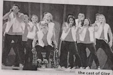
the cast of Glee