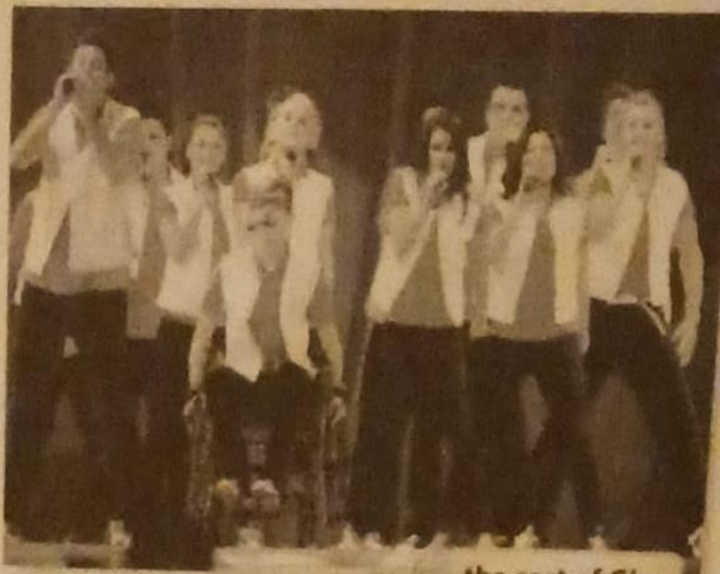
the cast of Glee