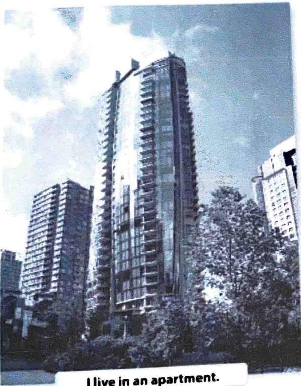
I live in an apartment.