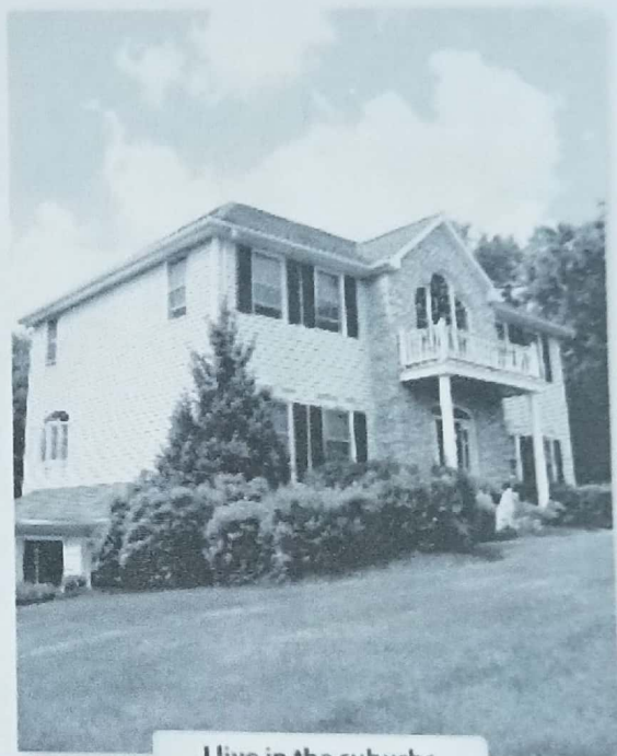
I live in the suburbs.

B Correct the false statements in part A.