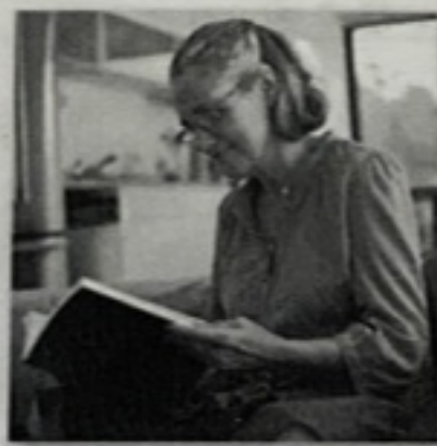
8. She's read a book