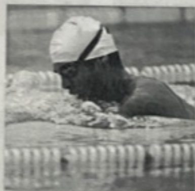
2. He's swimming