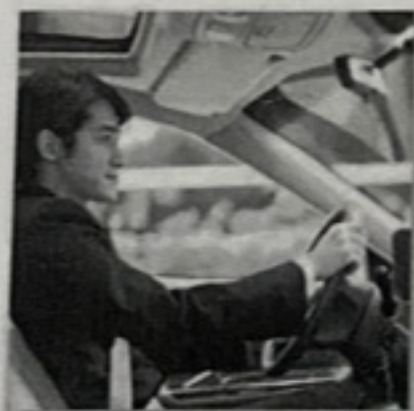
7. He's driving