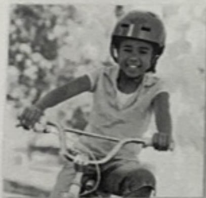
4. She's riding a bike