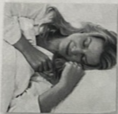
1. She's sleeping.