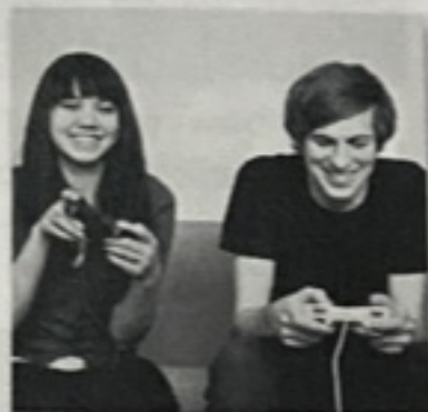
3. They's play video game