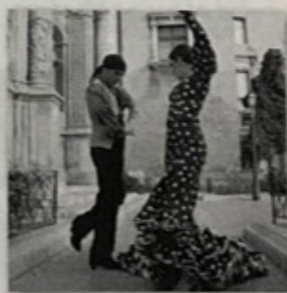
9. They's dancing