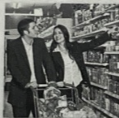
5. They's shopping