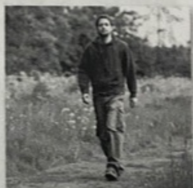
6. He's taking a walk