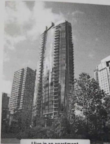
I live in an apartment.