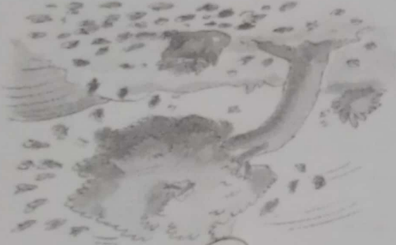
4. It's Fall.