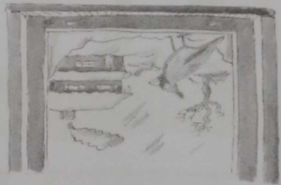
1. It's winter.

What season is it? How is the weather? Write two sentences about each picture.