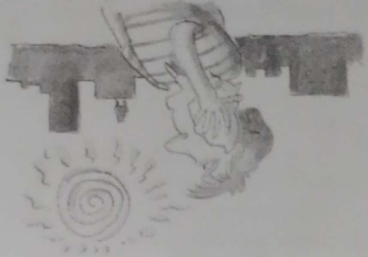
5. It's Summer.