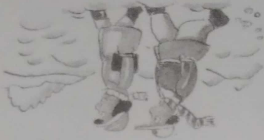
6. It's Winter.