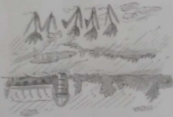
2. It's Spring.