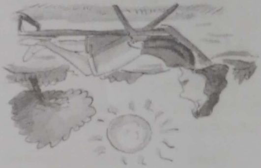
3. It's Spring.