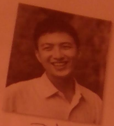
Blade 191 Twillo