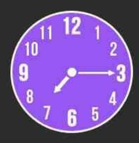
LAS SIETE Y CUARTO