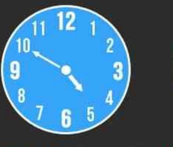
It's ten to five