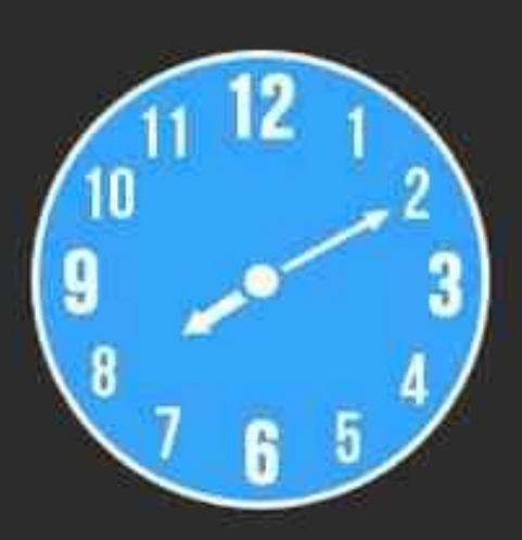
LAS OCHO Y DIEZ It's ten past eight