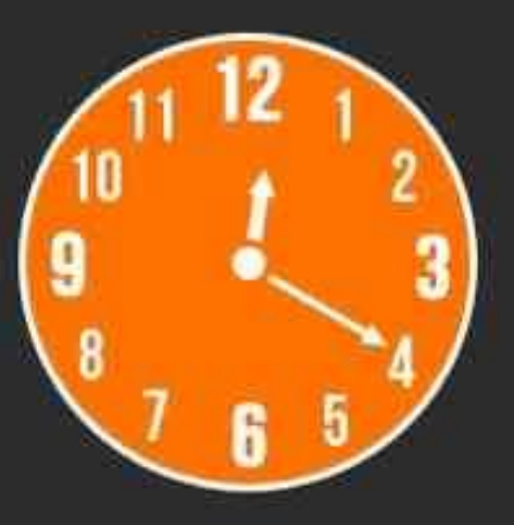
LAS DOCE Y VEINTE t's twenty past twelve