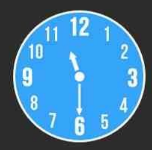
LAS ONCE Y MEDIA It's half past eleven