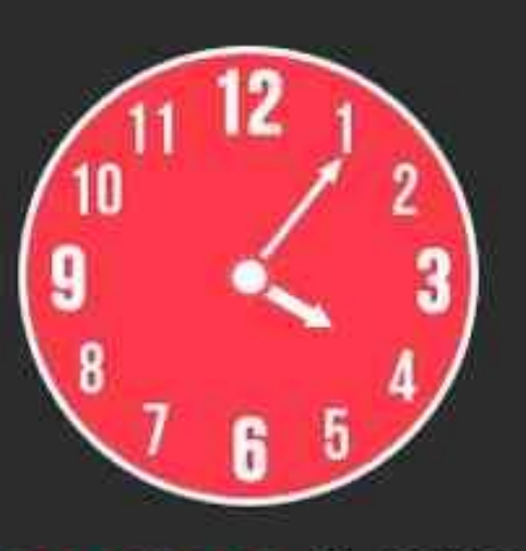
AS CUATRO Y CINCO It's five past four