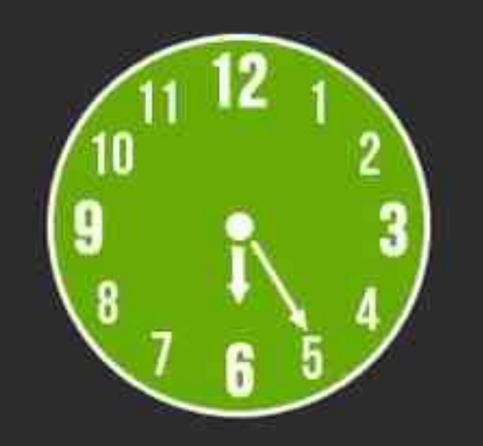
LAS SEIS Y VEINTICINCO It's twenty-five past six