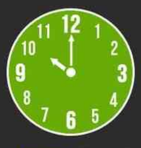
LAS DIEZ EN PUNTO It's ten o'clock