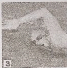
3 He is going to swim