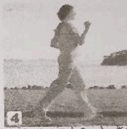
4 she is going to take a walk