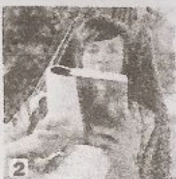
2 He is going to read book