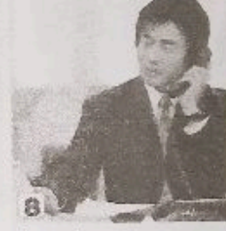
8 He is going to call