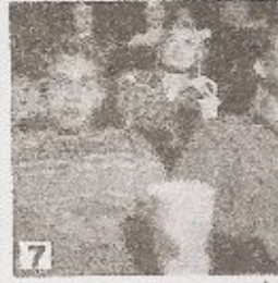
7 They are going to watch a movie