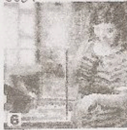
6 she is going to buy