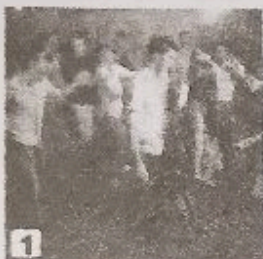
1 They are going to dance

A What are these people going to do this weekend? Write sentences. Then compare with a partner.