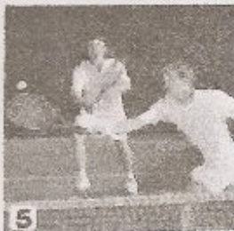
5 They are going to play Tennis