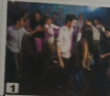
1 They are going to dance

A What are these people going to do this weekend? Write sentences. Then compare with a partner.