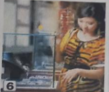
6 She is going to buy