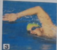
3 He is going to swim