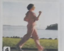
4 She is going to take a walk