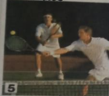
5 They are going to play tennis