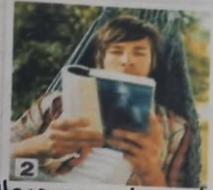
2 He is going to read