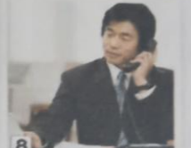
8 He is going to call