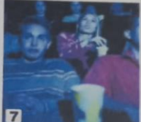
7 They are going to watch a movie