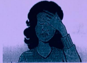
4. She has a headache.