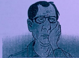
5. He has a toothache.