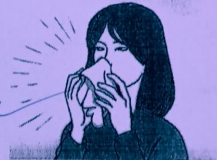
6. She has the flu.