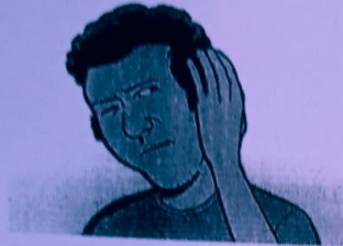
1. He has an earache.

2 What's wrong with these people? Write sentences.