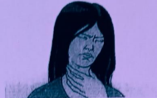
2. She has a sore throat.