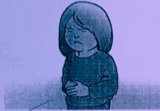
3. She has a stomachache.