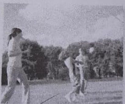
8. they're going to play volleyball