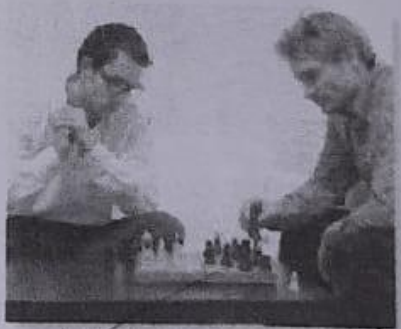
9. they are going to play chess

B What are you going to do next weekend? How about your family and friends? Write sentences.