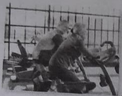
1. They're going to go to the gym.

A What are these people going to do next weekend? Write sentences.