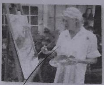
6. she is going to draw