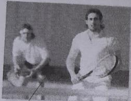
4. They're going to play tennis