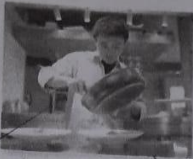
2. he is going to cook a cake