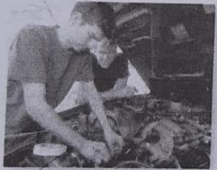
7. they're going to fix a car