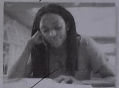
3. she is going to study