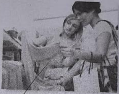
5. they're going to buy clothes