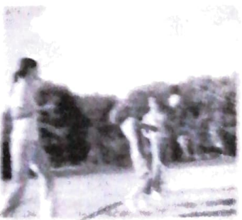
8. They are going to play volleyball.