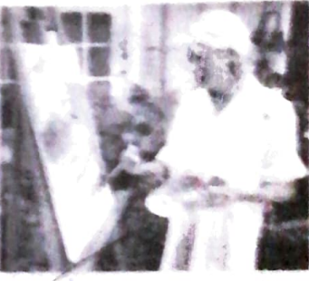
6. She is going to paint.