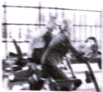
1. They are going to sit on the bench.

A What are these people going to do next weekend? Write sentences.