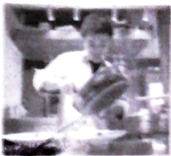
2. He is going to look at books.