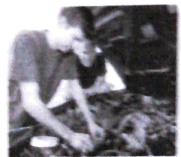
7. He is going to fix his car.