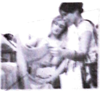
5. They're going to go to the shopping.