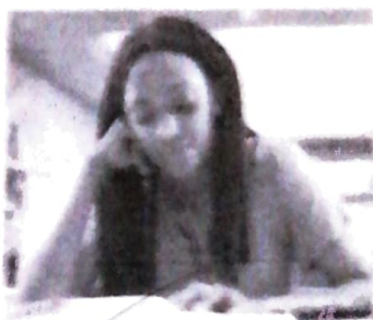
3. She is going to read.