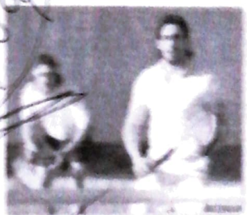
4. They are going to play soccer.