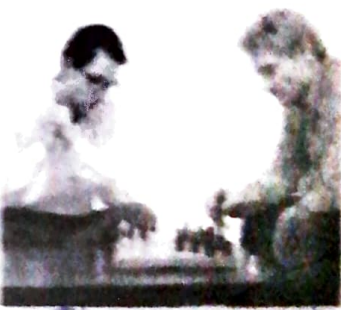
9. They are going to play chess.

B What are you going to do next weekend? How about your family and friends? Write sentences.