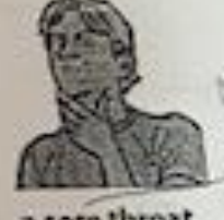
a sore throat