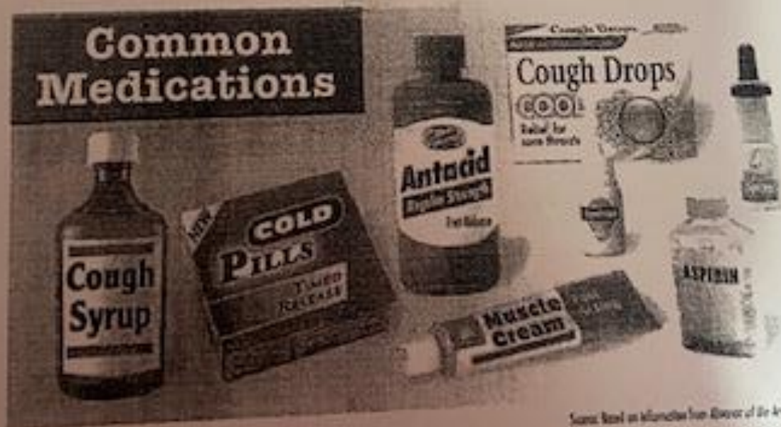
Some based on information from Reader of the American Heart

What medications do you have at home? What are these medications for?