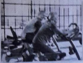
1. They're going to go to the gym.

A What are these people going to do next weekend? Write sentences.