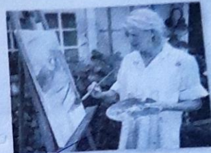
6. She is going to go to paint