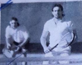
4. they are going to play tennis