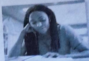
3. She is going to read