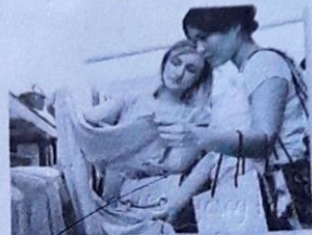
5. they are going to buy