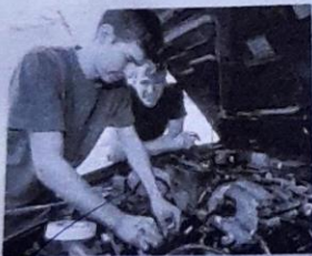
7. they are going to fix a car