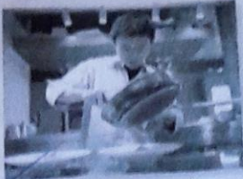
2. He is going to go to a cook's