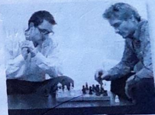
9. they are going to a play chess