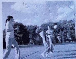
8. they are going to a play