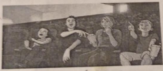
7. They watched movies.