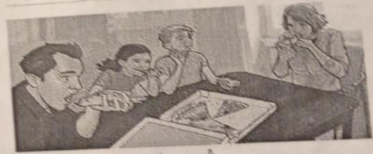
4. They ate.