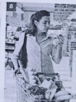
go grocery shopping