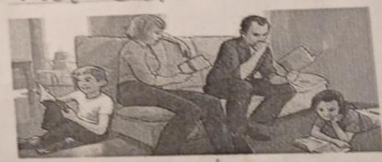
6. They read.