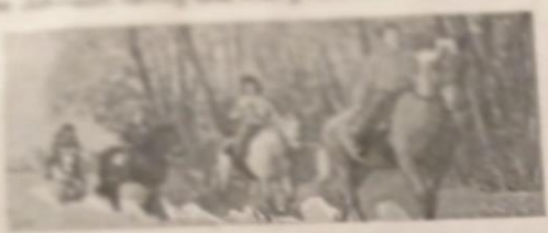
1. They rode horses.

A. The Johnson family did many fun activities last summer. Write sentences about them.