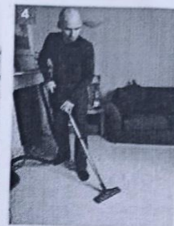
clean the house