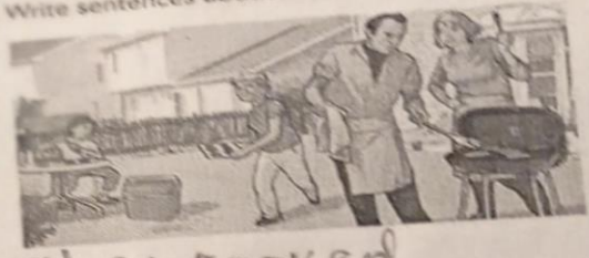
2. They cooked.