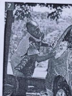
wash the car