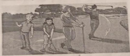
5. They played tennis.