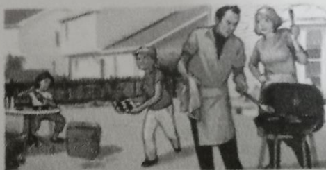
2. they did grilled meet