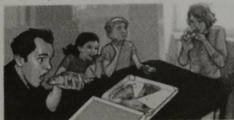
4. they ate pizza