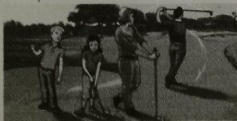
5. they played golf