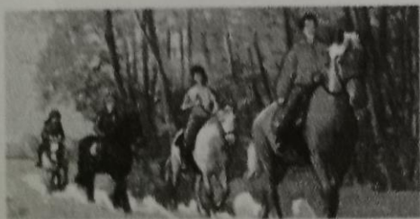
1. They rode horses.

A The Johnson family did many fun activities last summer. Write sentences about them.