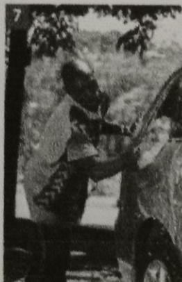
wash the car