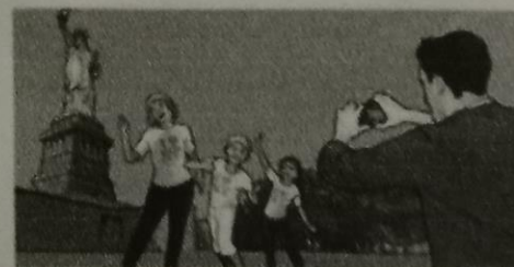
8. they take some pictures.

B Write sentences about your activities last summer.