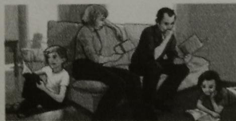
6. they read books