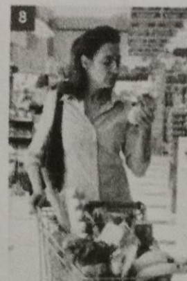
go grocery shopping