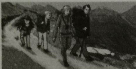
3. they climbed montains