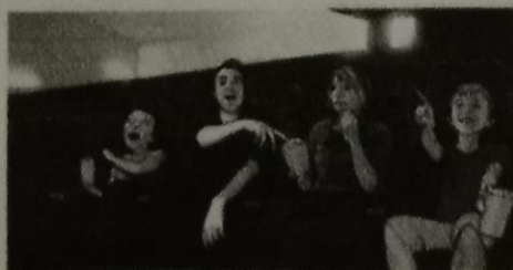
7. they saw a movie