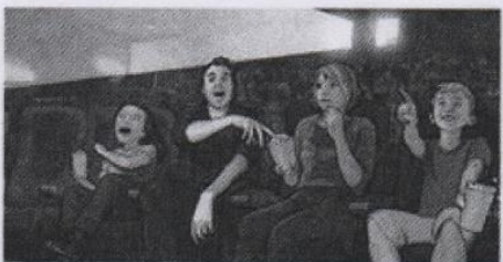
7. THEY SAW A MOVIE.