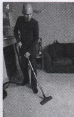
clean the house