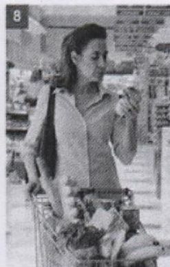
go grocery shopping