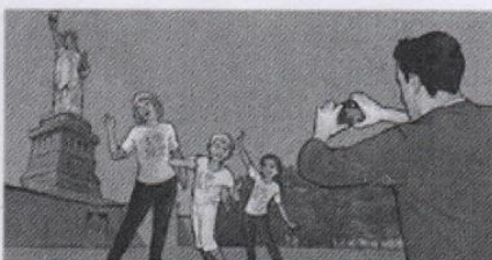
8. THEY TOOK A PICTURE.

B Write sentences about your activities last summer.