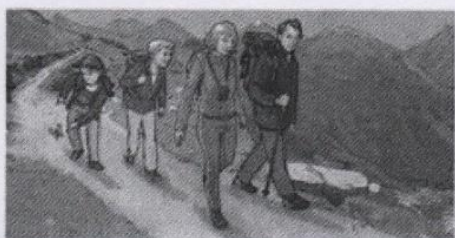
3. THEY WENT HIKING TO A MOUNTAIN.