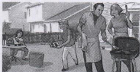
2. THEY HAD A PICNIC.