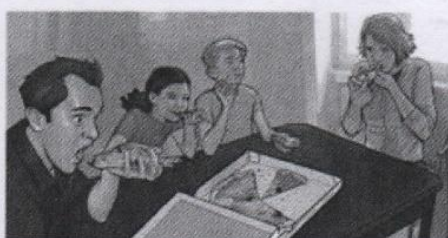
4. THEY ATE PIZZA