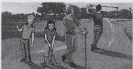
5. THE PLAYED GOLF.