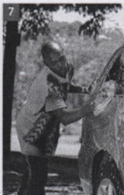
wash the car