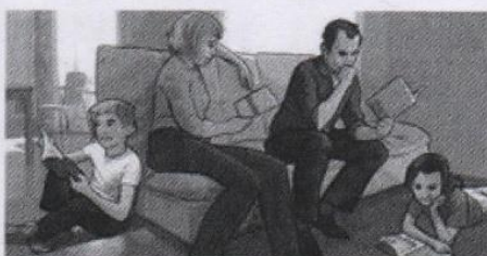
6. THEY READ A BOOK.