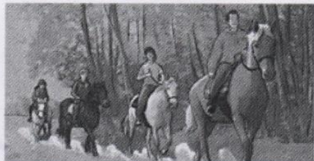
1. They rode horses.

A The Johnson family did many fun activities last summer. Write sentences about them.