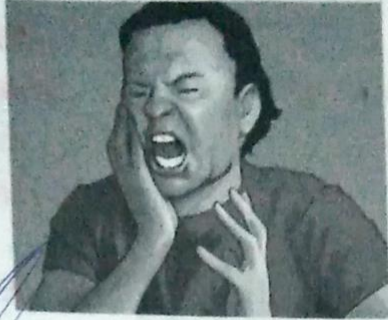
1. He has a toothache.