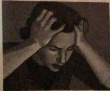
5. She has a headache.