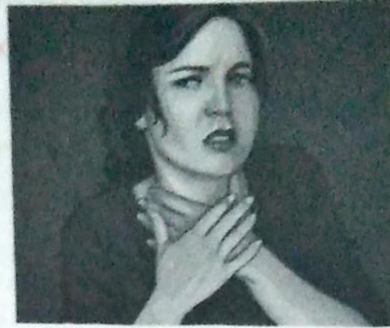
2. She has a sore throat.