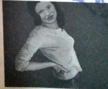
6. She has a backache.