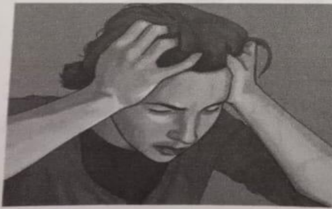
5. She has a headache.