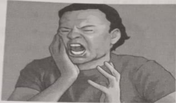
1. He has a toothache.

2 What's wrong with these people? Write sentences.