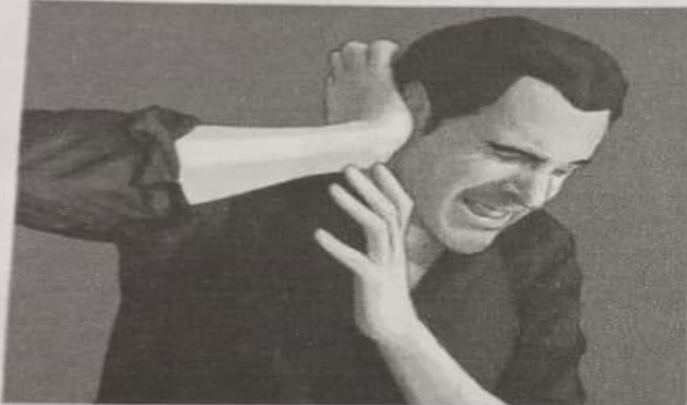
3. He has an carache.