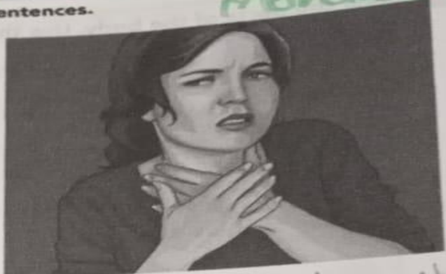
2. She has a sore throat.