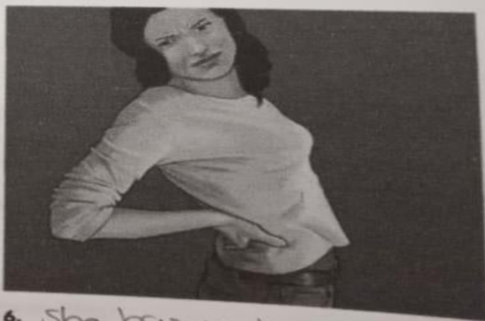
6. She has a backache.