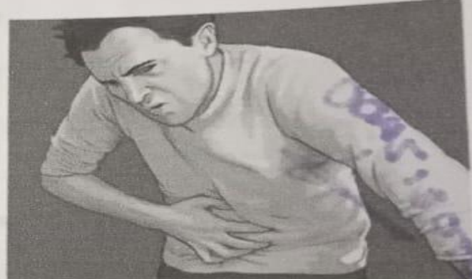
4. He has a stomachache.