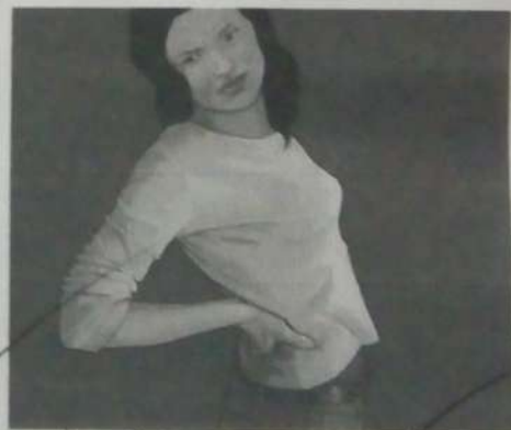
6. She has a backache.