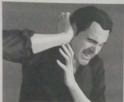
3. He has an earache.