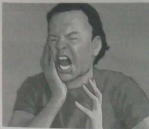
1. He has a toothache.