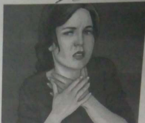
2. She has a sore throat.