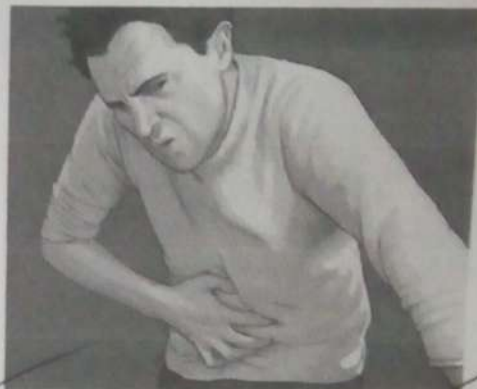
4. He has a stomachache.