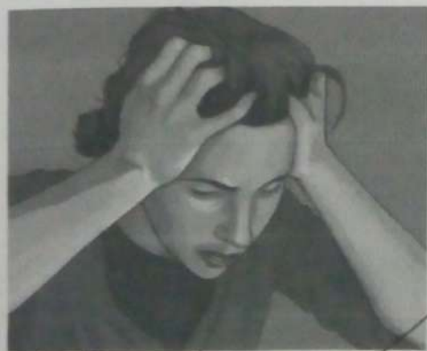
5. She has a headache.