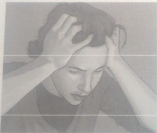
5. He has a headache.