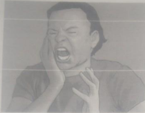
1. He has a toothache.

2 What's wrong with these people? Write sentences.