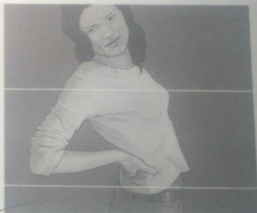
6. she has a backache.