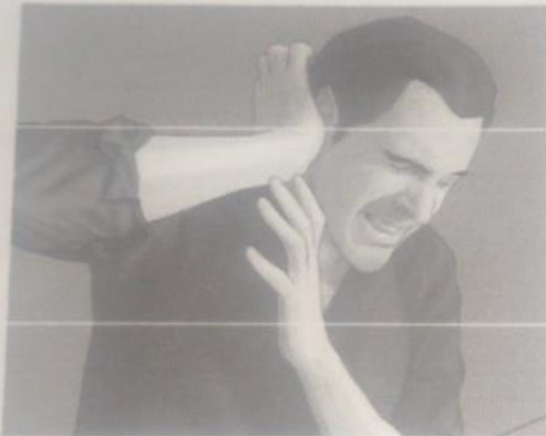
3. He has an earache.