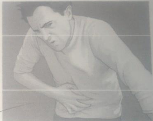
4. he has a stomachache.