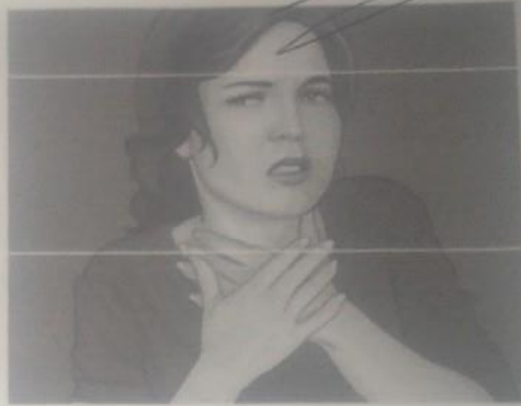
2. She has a sore throat.