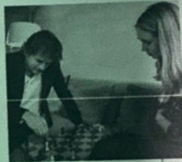
6. They're going to play chess