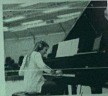
3. She's going to play piano