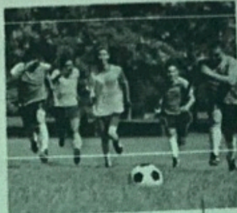
2. They're going to play soccer