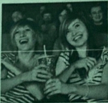
7. They're going to cinema