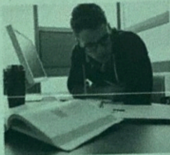
5. He's going to read