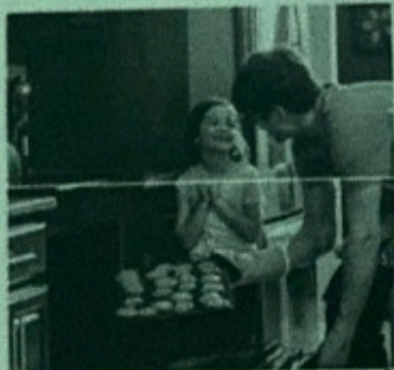
8. They're going to cook