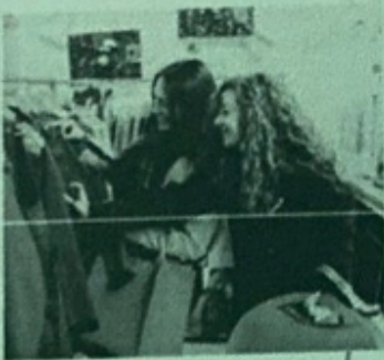
4. They're going to shop