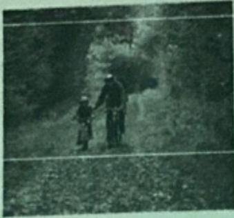
1. They're going to go bike riding

A What are these people going to do next weekend? Write sentences.