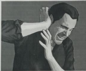
3. He has an earache