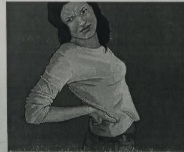
6. She has a backache