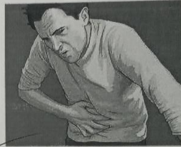
4. He has a stomachache