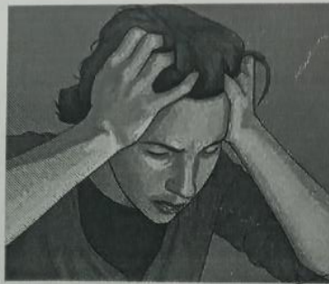
5. She has a headache