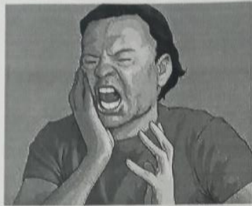
1. He has a toothache.

2 What's wrong with these people? Write sentences.