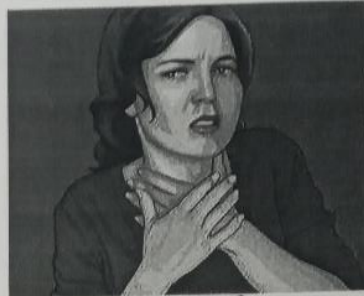
2. She has a sore throat ✓