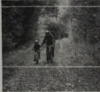
1. They're going to go bike riding

A What are these people going to do next weekend? Write sentences.