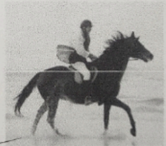
9. he's going to ride a horse

B What are you going to do next weekend? How about your family and friends? Write sentences.