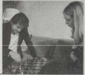
6. they're going to play chess