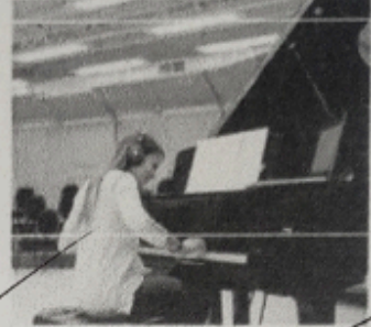
3. She's going to play piano