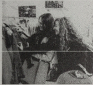
4. they're going to shop