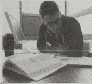
5. he's going to read