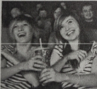
7. they're going to cinema