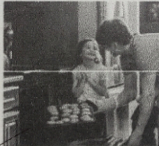
8. they're going to cook