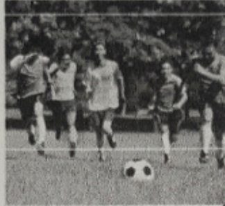
2. they're going to play soccer