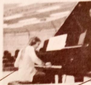
3. She's going to play the piano.