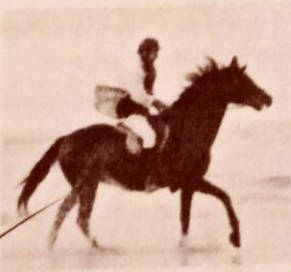
9. She's going to ride a horse.

B What are you going to do next weekend? How about your family and friends? Write sentences.