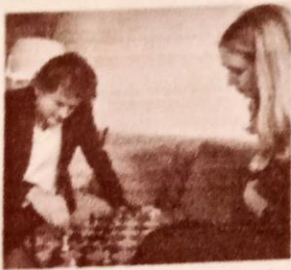
6. They're going to play chess.