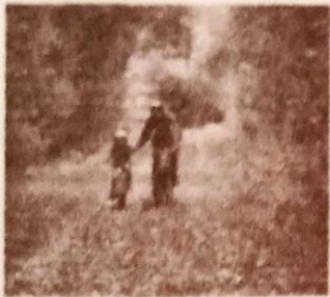
1. They're going to go bike riding.

A What are these people going to do next weekend? Write sentences.