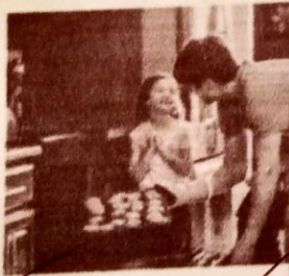
8. They're going to cook cookies.