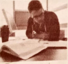
5. He's going to study.