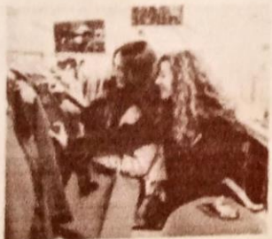
4. They're going to buy clothes.