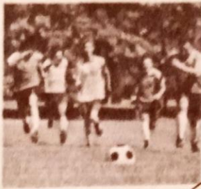
2. They're going to play soccer.