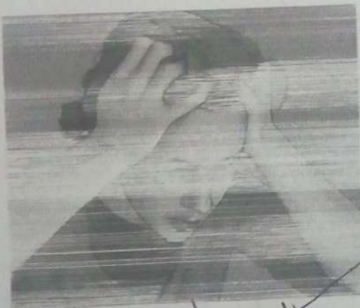
5. he has a headache