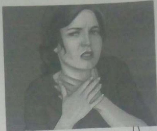
2. She has a sore throat.