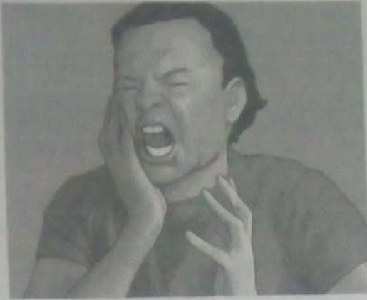
1. He has a toothache.

2 What's wrong with these people? Write sentences.