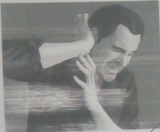
3. he has an earache