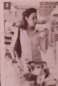
go grocery shopping