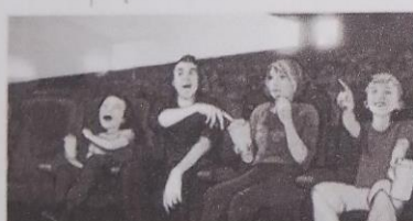
7. They went to the movies.