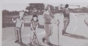
5. They played.