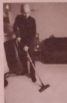
clean the house