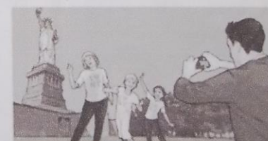
8. They took pictures.

B Write sentences about your activities last summer.