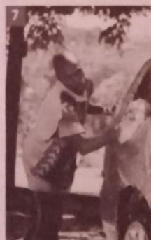
wash the car