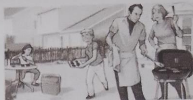
2. They cooked in the garden.