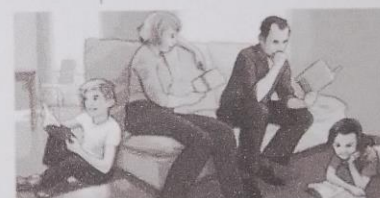
6. They read books.