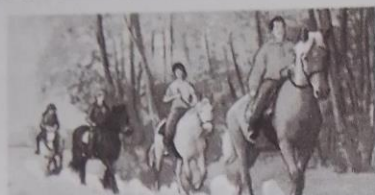
1. They rode horses.

A The Johnson family did many fun activities last summer. Write sentences about them.