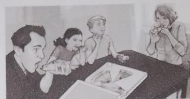
4. They ate pizza.