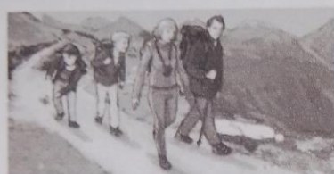
3. They walked a lot.