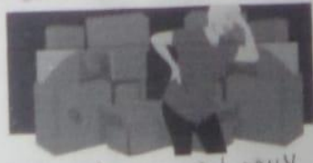
7. Do not pick up heavy things