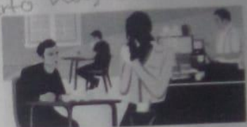
2. go home early