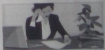
8. Do not work too hard