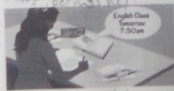
5. don't stay up late