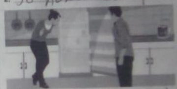
4. have drink some water