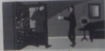
6. have a hot drink