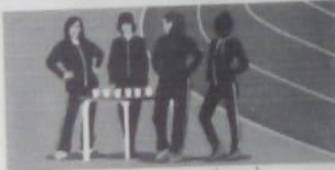
3. You just go to the pharmacy