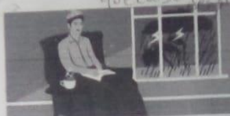
1. Don't go outside

una bebida caliente levantar cosas pesadas trabajar muy duro ir a la tienda