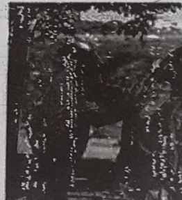
wash the car