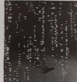
clean the house