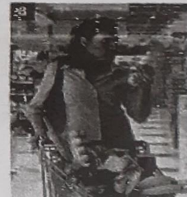
go grocery shopping