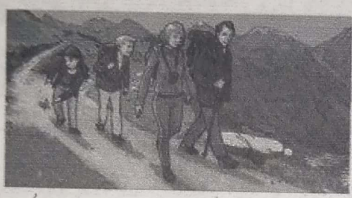
3. They walked on the mountain