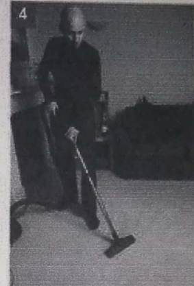
clean the house