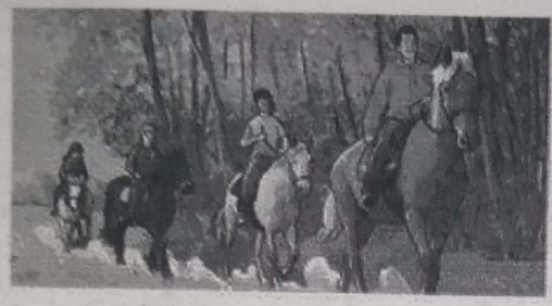
1. They rode horses.

A The Johnson family did many fun activities last summer. Write sentences about them.