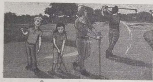
5. They played