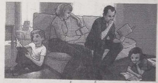
6. They read a book