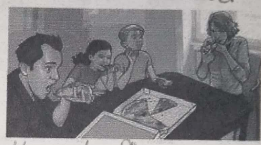
4. they ate Pizza