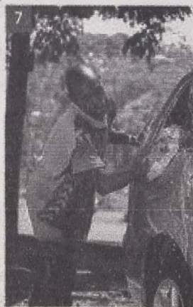
wash the car