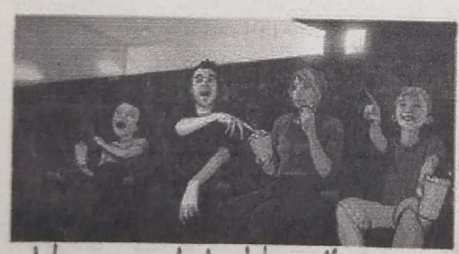
7. they went to the cinema to see a movie.