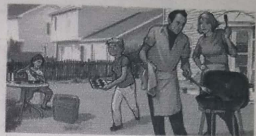
2. They made a barbecue.