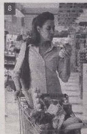
go grocery shopping