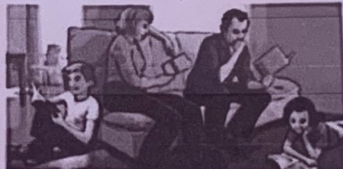
6. They read books