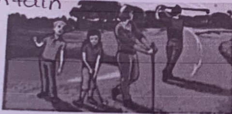
5. They played golf