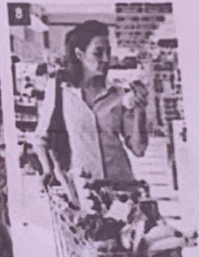
go grocery shopping