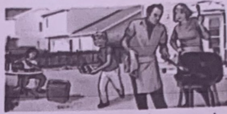
2. They cooked burger's in family