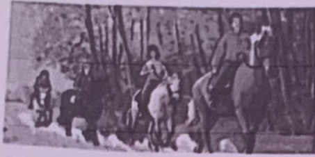
1. They rode horses.

A The Johnson family did many fun activities last summer. Write sentences about them.