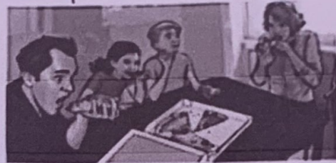
4. They ate pizza