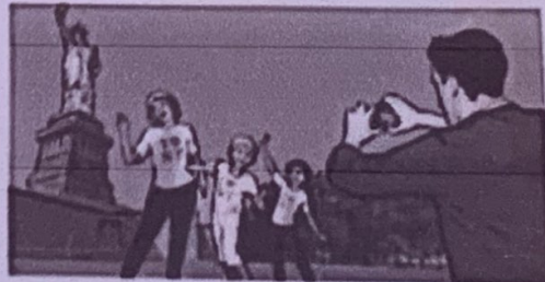
8. They took a photo

B Write sentences about your activities last summer.