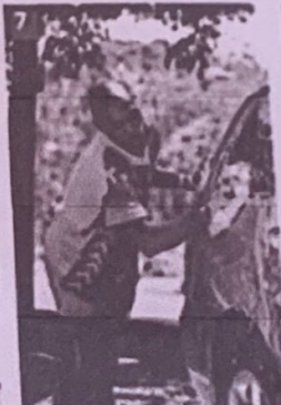
wash the car