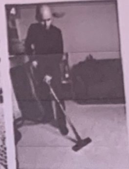
clean the house