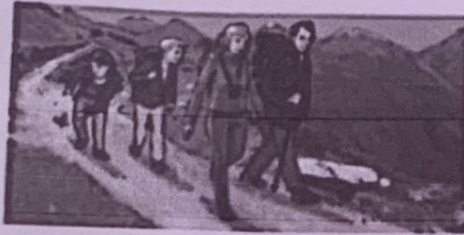
3. They climbed a mountain