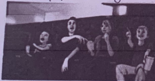
7. They watched a movie