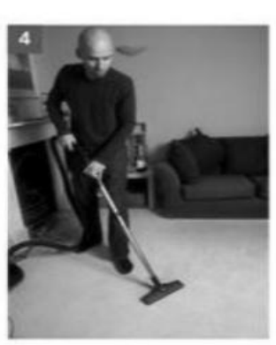
clean the house