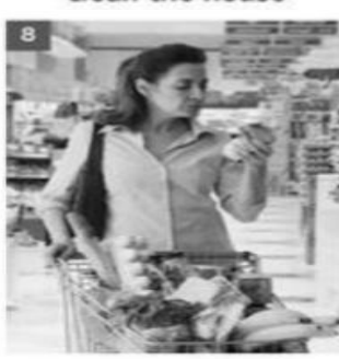
go grocery shopping