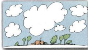
2. It's cloudy.