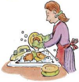
1. wash the dishes