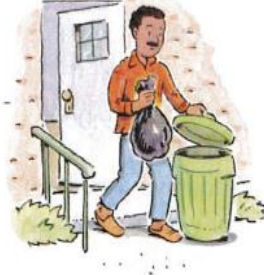
4. take out the garbage