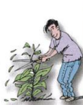
8. It`s warm.