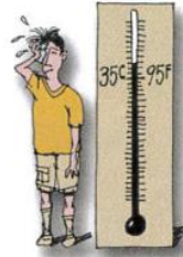
6. It`s hot.