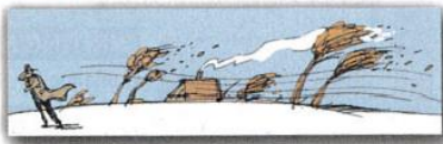
3. It`s windy.