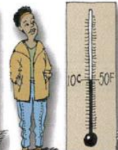
9. It`s cool.

Exercise 1. Translate the vocabulary. (Traduce el vocabulario de la parte de arriba)