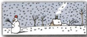
5. It`s snowing.