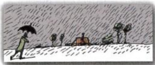
4. It`s raining.