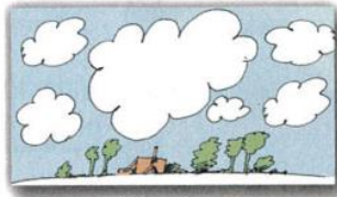
2. It`s cloudy.