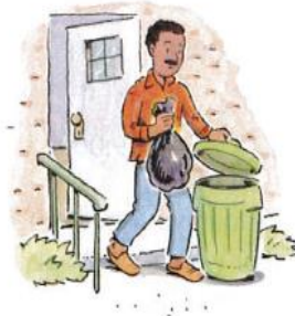
4. take out the garbage