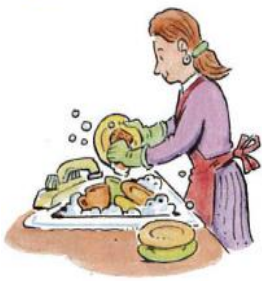
1. wash the dishes

Exercise 2. Write 5 questions using questions with "how often" in present simple (Escribir 5 oraciones usando las preguntas "how often" en presente simple usando el vocabulario debajo)