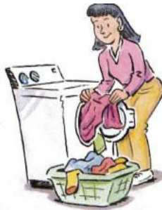
3. do the laundry