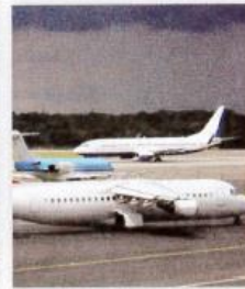
7. an airport