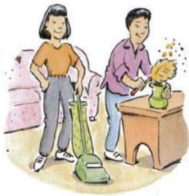
2. clean the house