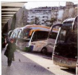
1. a bus station

Escribe 6 preguntas con sus repuestas usando "Where" y el vocabulario debajo.