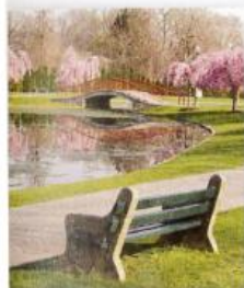
4. a park