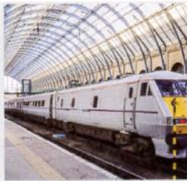
2. a train station