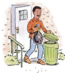
4. take out the garbage