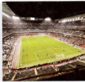
3. a stadium