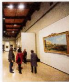
6. a museum