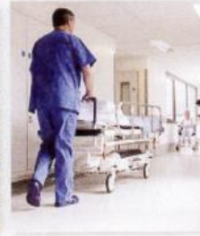
8. a hospital