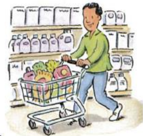
5. go shopping

Exercise 1. Translate the vocabulary. (Traduce el vocabulario de la parte de arriba)