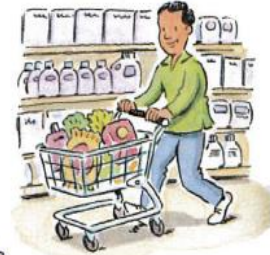
5. go shopping

Example: How often do you travel to Tuxtla?