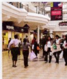
5. a mall