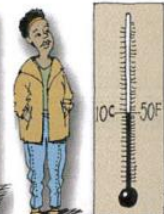
9. It`s cool.