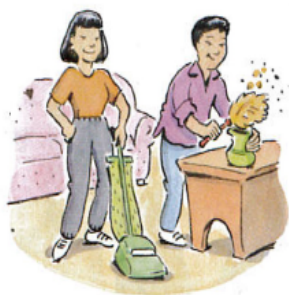
2. clean the house