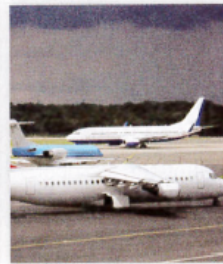
7. an airport