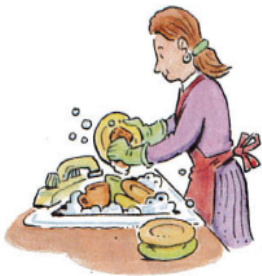
1. wash the dishes

Exercise 2. Write 5 questions using questions with "how often" in present simple (Escribir 5 oraciones usando las preguntas "how often" en presente simple usando el vocabulario debajo)