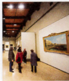
6. a museum