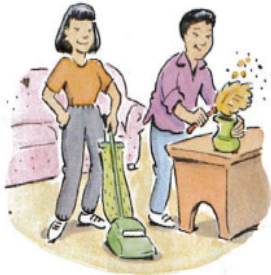
2. clean the house