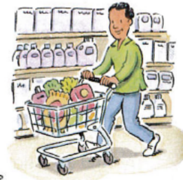
5. go shopping

Example: How often do you travel to Tuxtla?