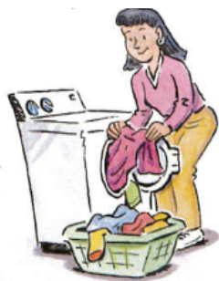
3. do the laundry