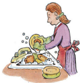
1. wash the dishes