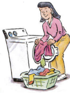
3. do the laundry