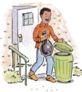
4. take out the garbage