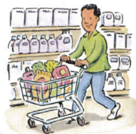
5. go shopping

Exercise 1. Translate the vocabulary. (Traduce el vocabulario de la parte de arriba)