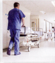
8. a hospital