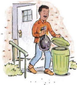
4. take out the garbage