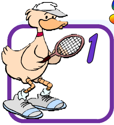
T e n n i s