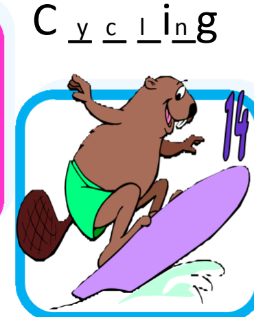
s u r f