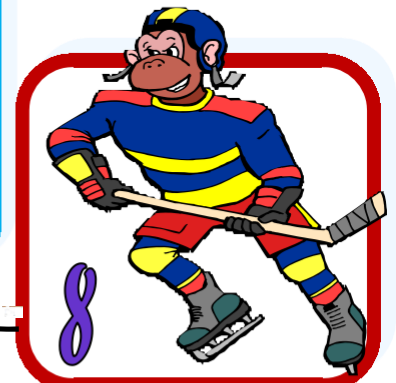
I l c e H o c k e y