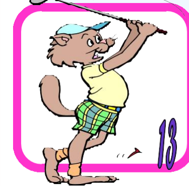
g o l f