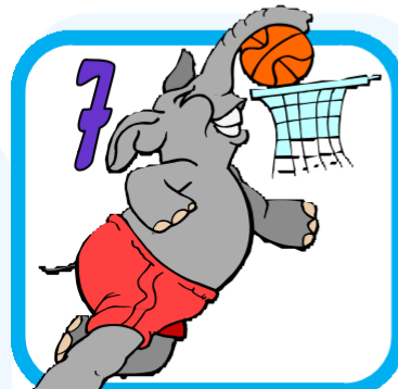
B a s k e t b a l