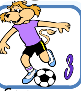
S o c c e r