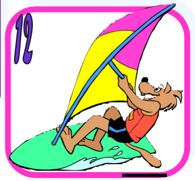
K i t e s u r f