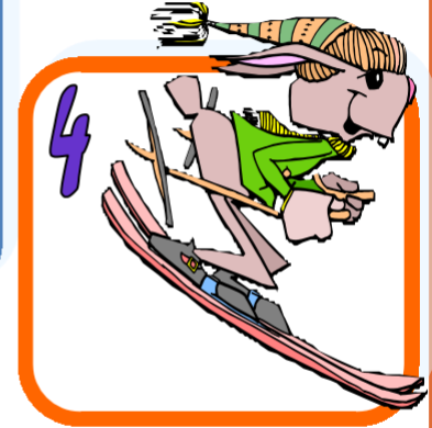
S k i i n g