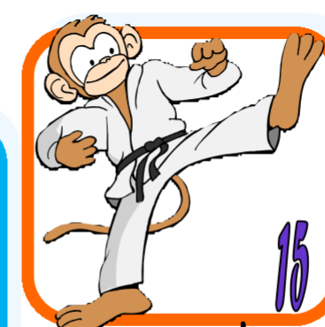
k a r a t e