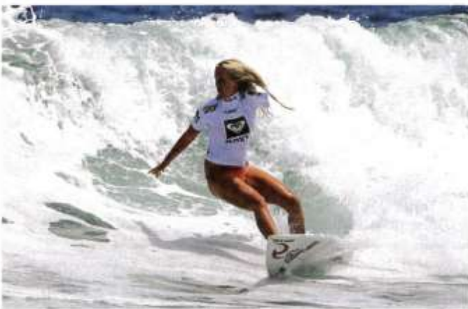
Hamilton was attacked by a tiger shark when she was thirteen.