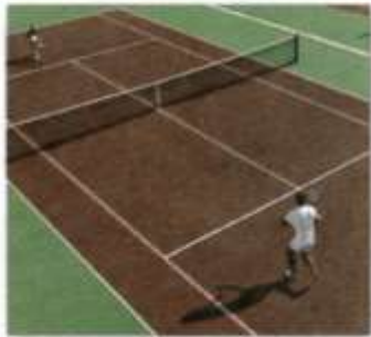
a tennis court