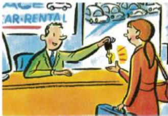
a rental car