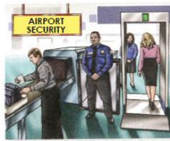
⑤ go through security