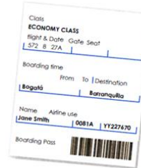
⑥ a boarding pass