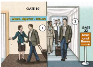
① depart ② arrive