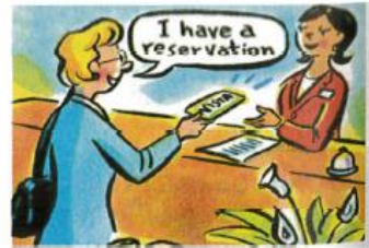
a hotel reservation