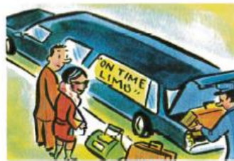
a limousine/ a limo