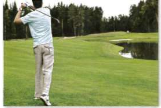
a golf course