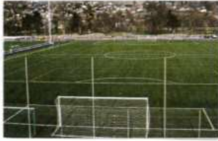
an athletic field