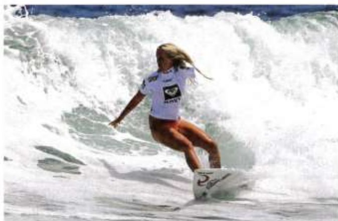
Hamilton was attacked by a tiger shark when she was thirteen.

In 2011, Hollywood made a movie about her experience. Bethany has a happy life and got married in 2013.