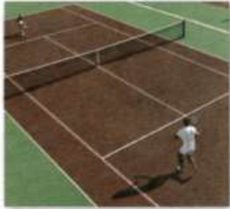
a tennis court