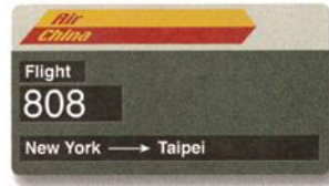
a non-stop flight