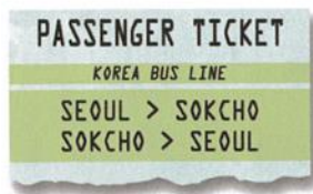
a round-trip ticket