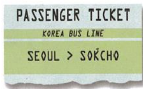
a one-way ticket