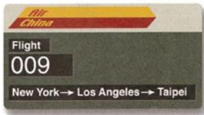
a direct flight